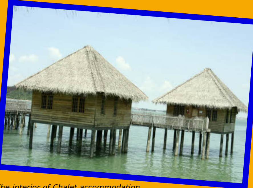
The interior of Chalet accommodation (TOP), a view from the beach and (above) rooms on stilts.

For more information about Smiling Hill, including maps showing how to find us go to our website at www.smilinghillbatam.com